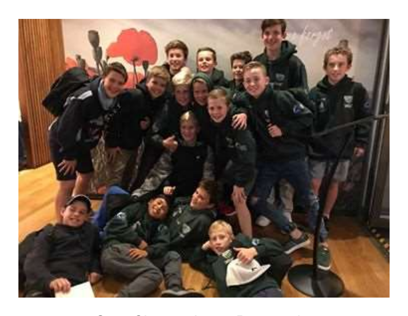
State Champs Jersey Presentation