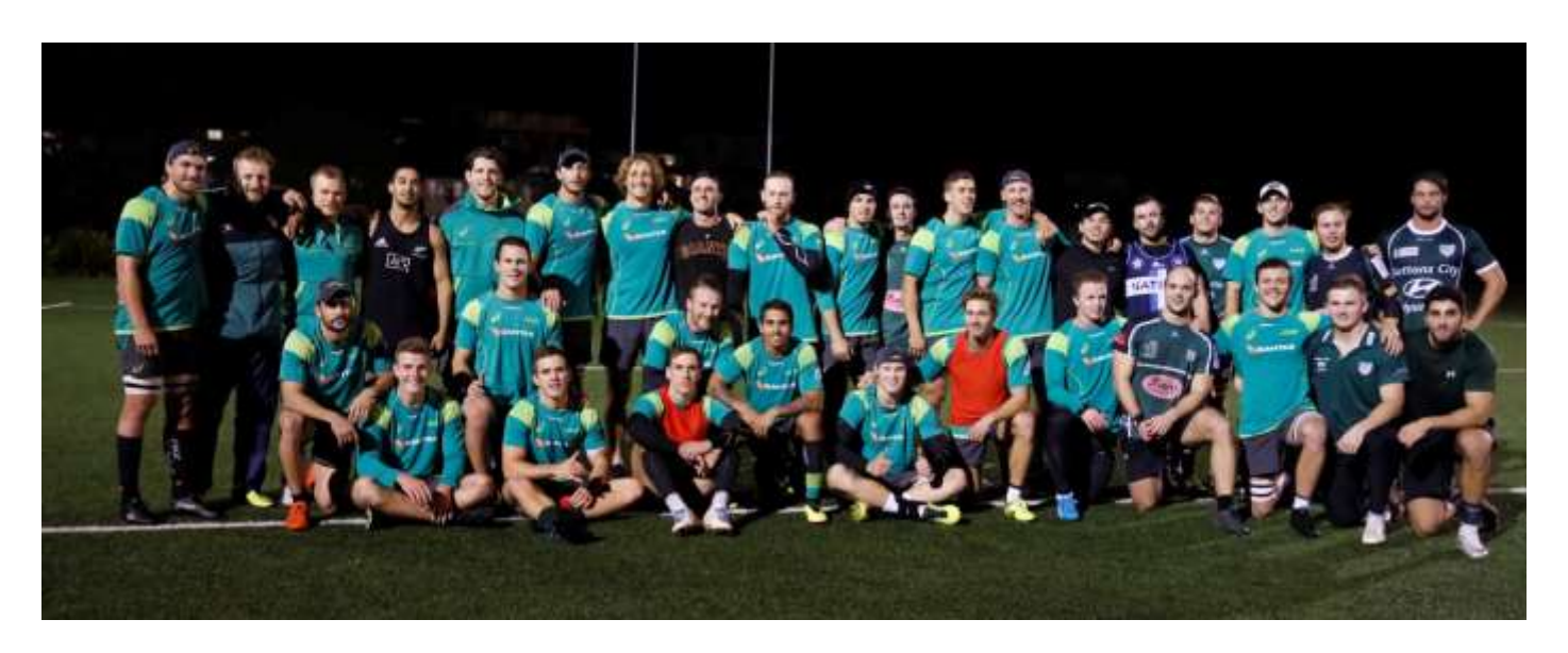
Randwick Rugby training with the Aussie 7s