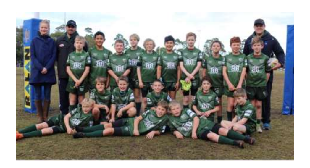
NSWJRU State Championships