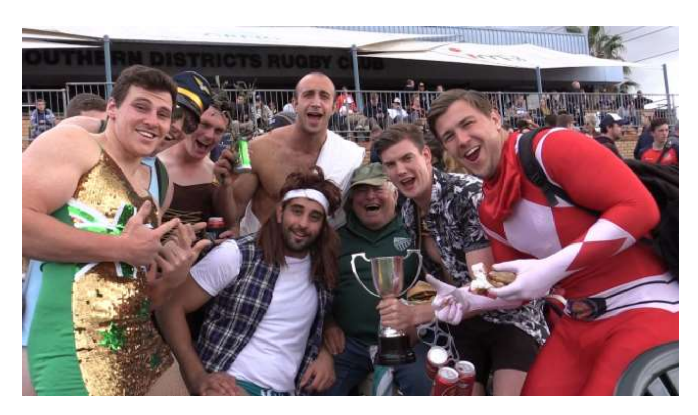
Silly Sunday supporters at the Colts GF