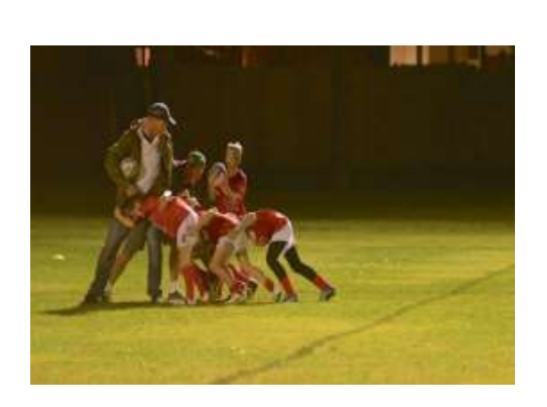
South Coogee juniors