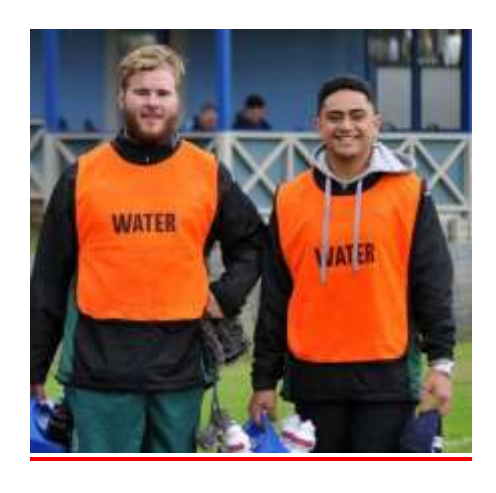
Colts water boys