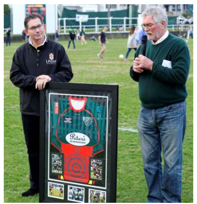
Randwick Rugby was pleased to support and promote the UNSW Nura Gili program