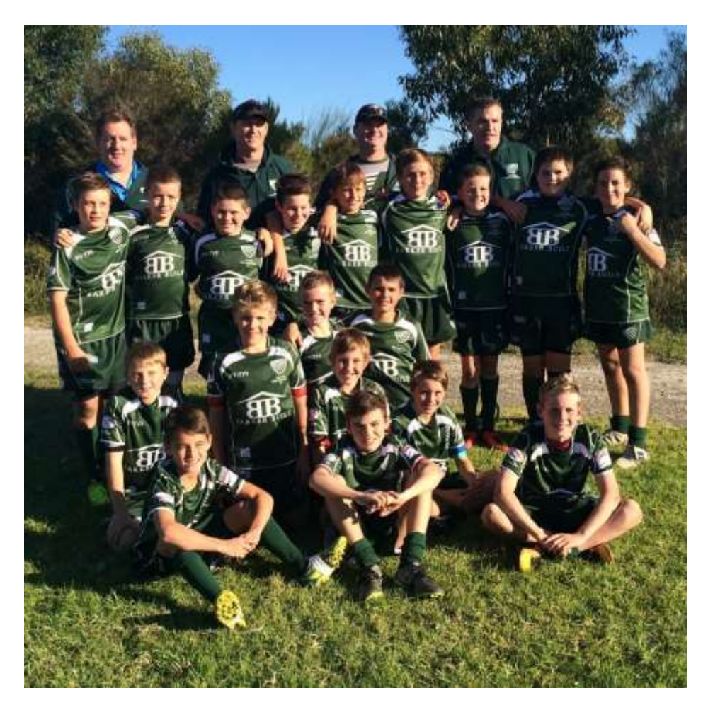
Randwick U11 Whites