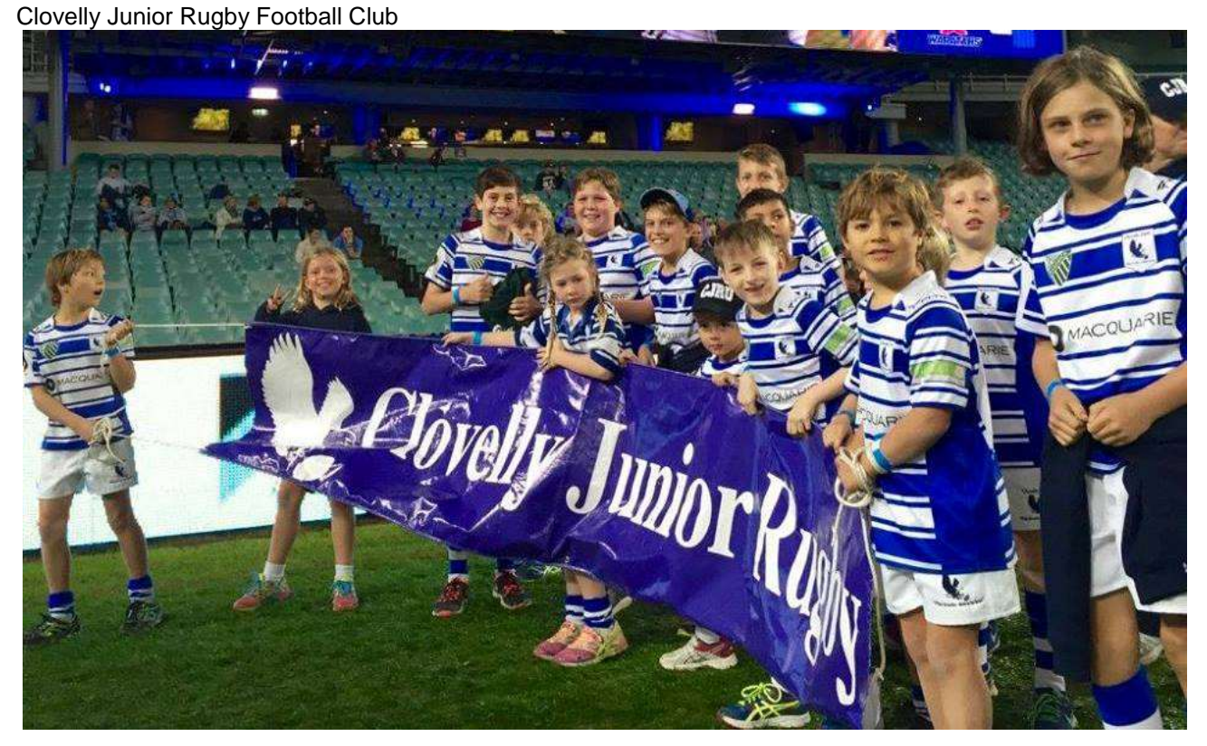
Clovelly Juniors at the SFS