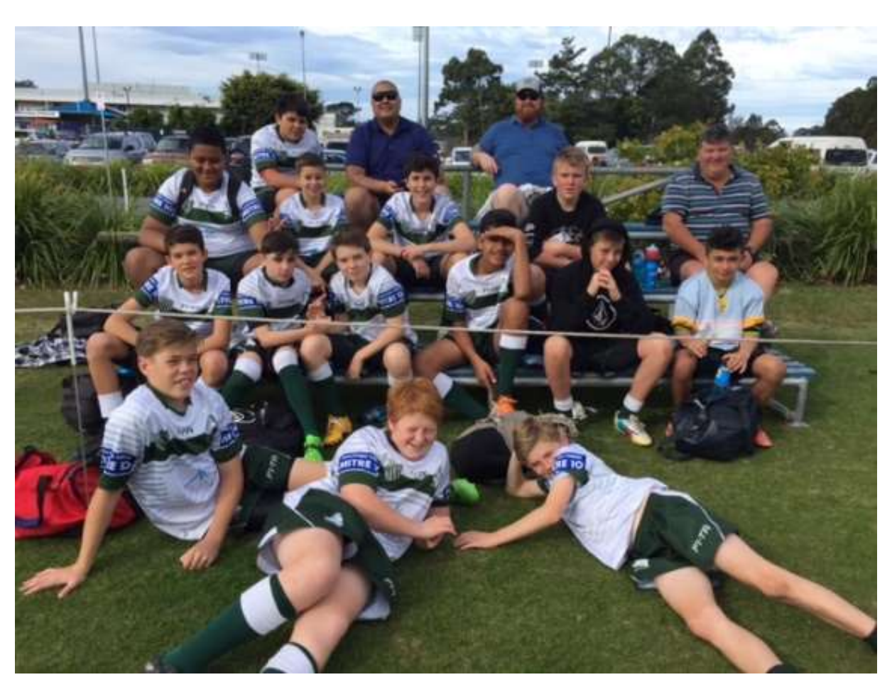
Myrtle Green Warriors at the Coffs 10s