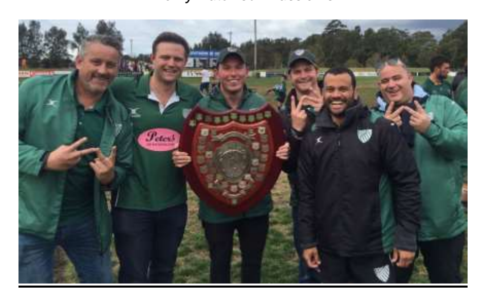
2016 Colts Coaches and the Shell Trophy Premiership Shield