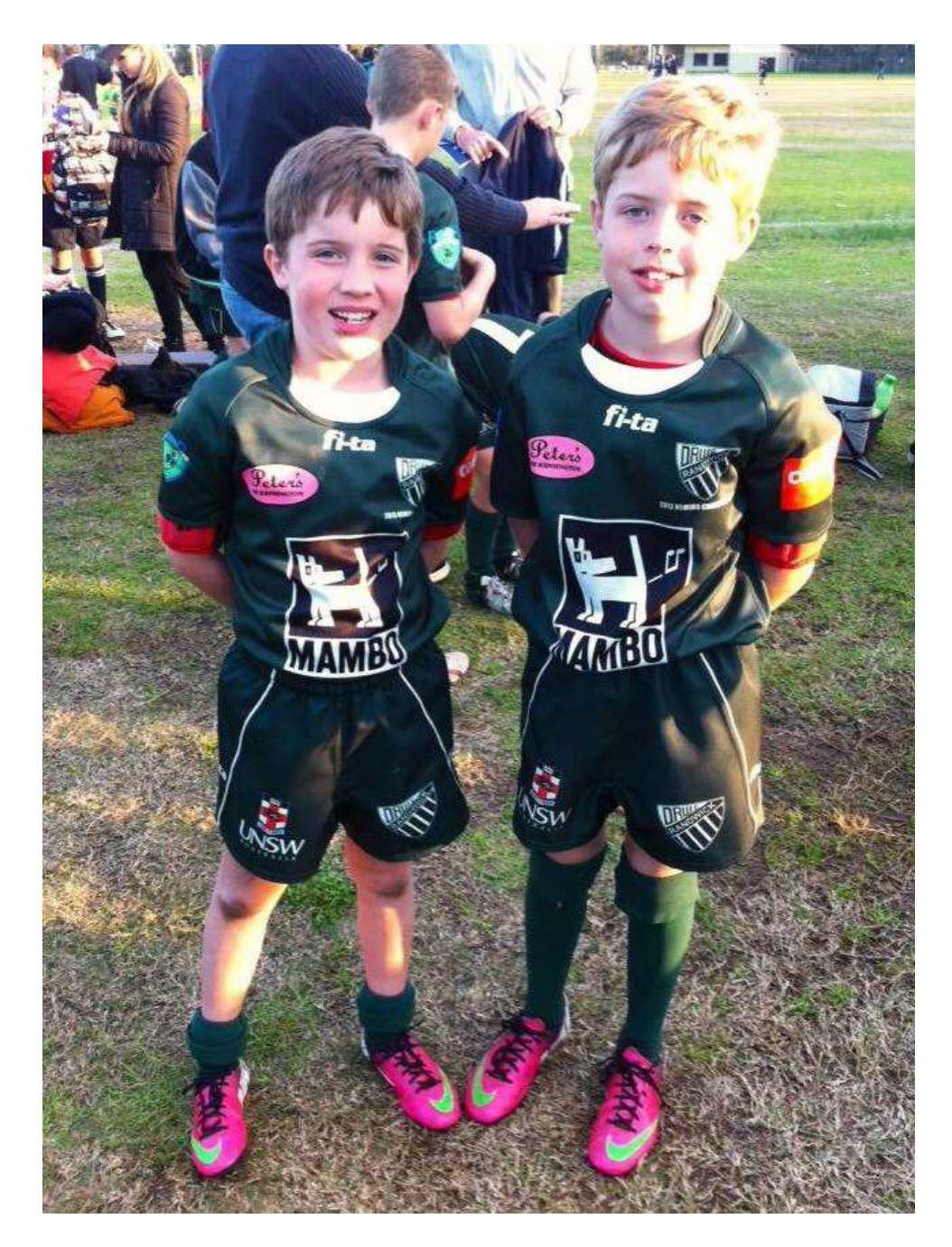
RANDWICK RUGBY JUNIOR ACADEMY 2016/2017

"We are a proud club at Randwick Rugby. We are proud of our history, our achievements and our hard-earned international reputation. We pride ourselves on our record of elite level players, captains, administrators and coaches. We are proud of our junior clubs who offer and support the introduction of our great game to countless numbers of children.