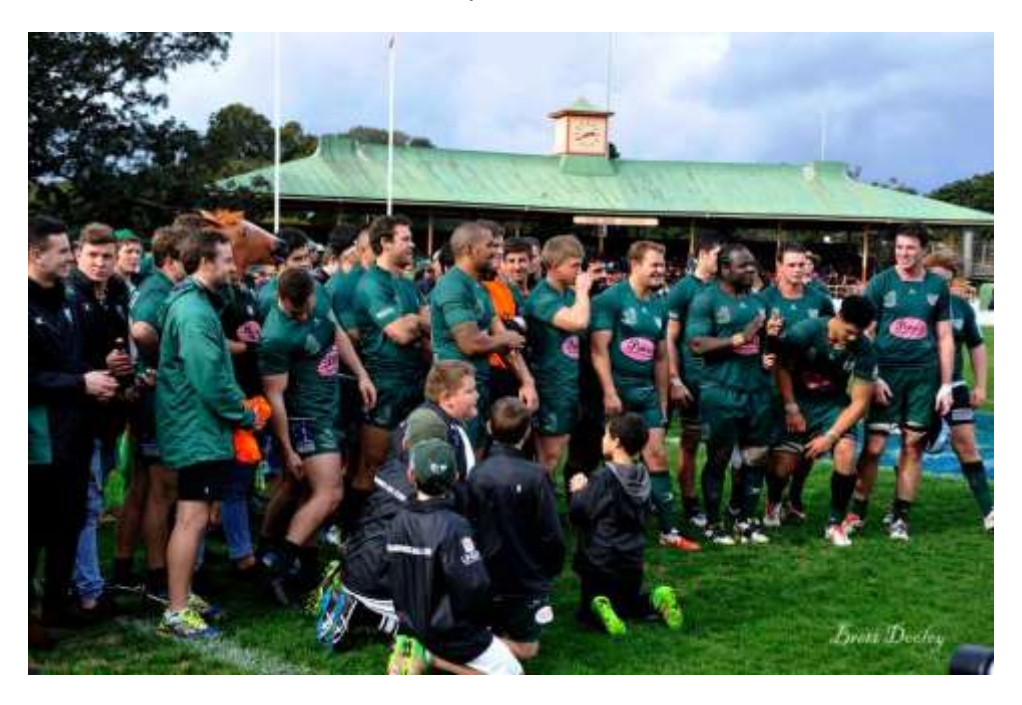
Premiership winning 2<sup>nd</sup> Grade team and supporters