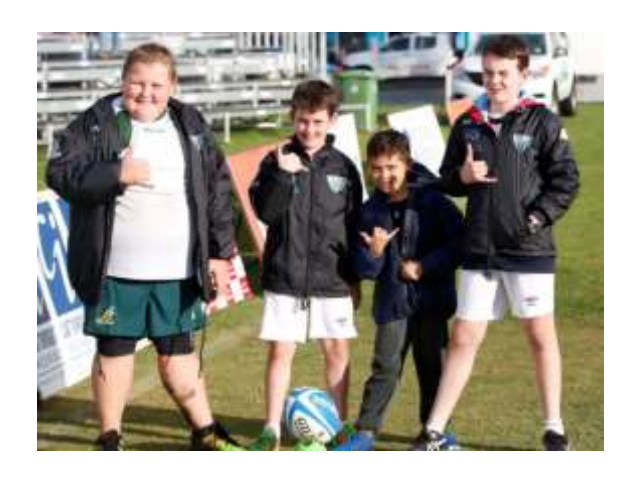
Some of our champion Randwick ballboys