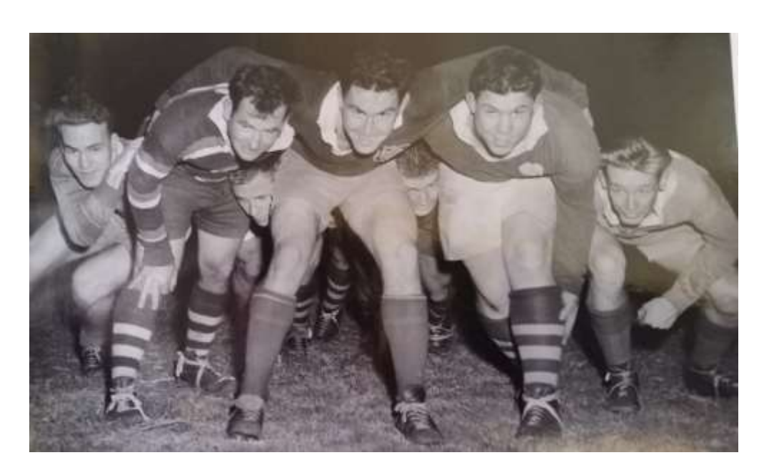
The 1959 Premiers Forwards