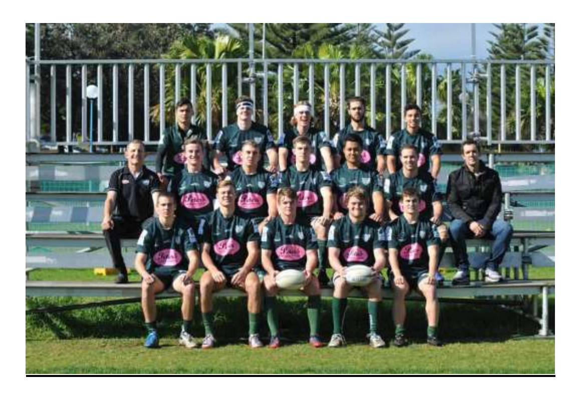
Second Grade Colts