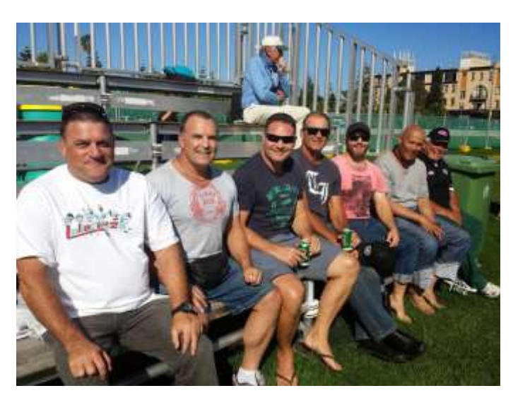
Reunion at Coogee Oval