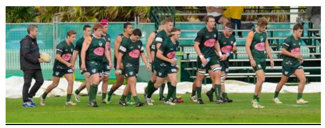
Colts Warm-up at Coogee Oval