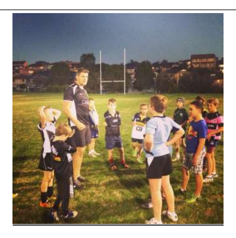
President, Randwick Juniors Report

The year 2014 saw an amazing number of nearly 1,000 kids take to the fields in a variety of age groups and competitions. Randwick Juniors is extremely appreciative of the band of volunteers including Club Presidents, Committee members, Sponsors and even parents who man the BBQ, to ensure the kids get on the field each week. With the goal posts now down at Latham and Nagle Park below is a summary of a fantastic season of junior rugby: