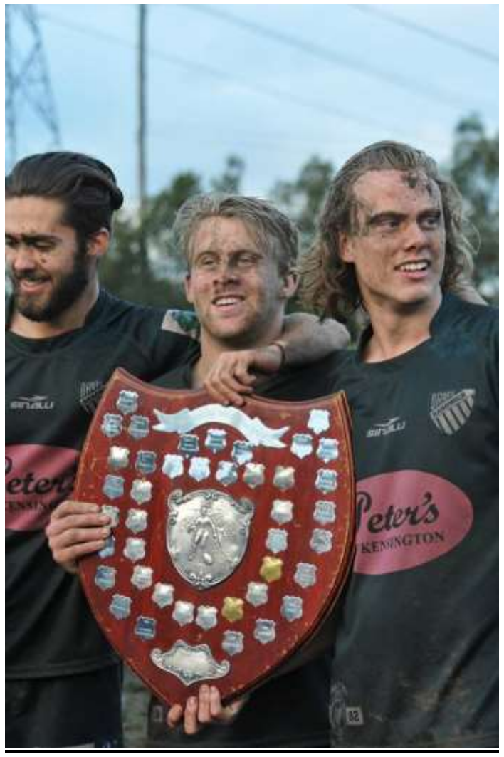
Premiership winning First Grade Colts