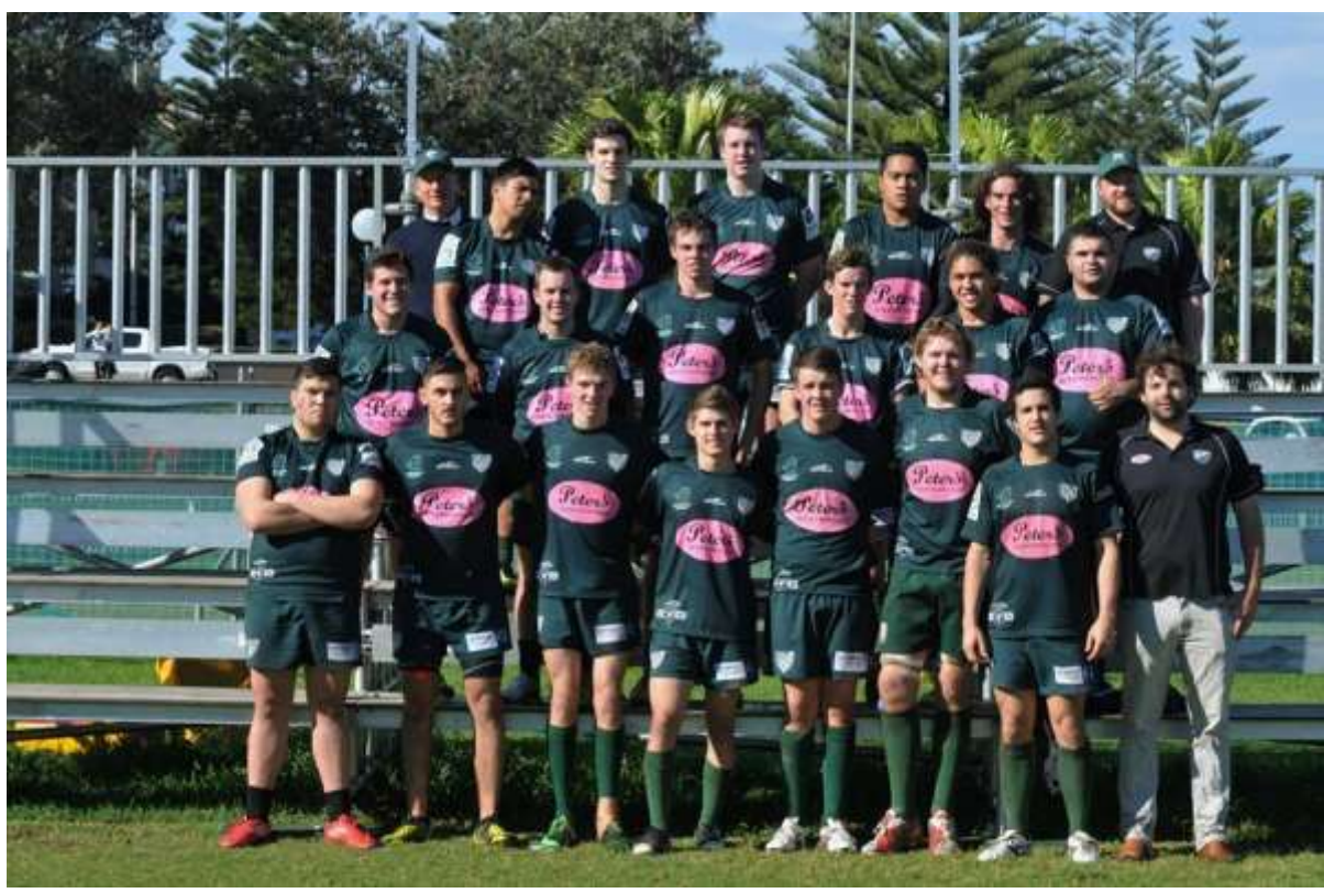
Third Grade Colts