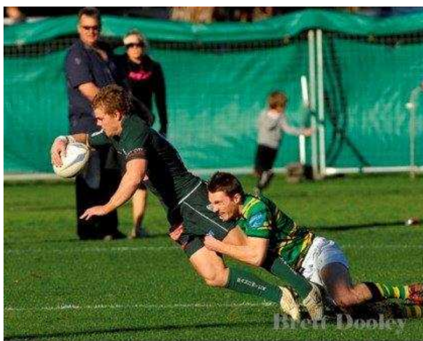
Round 12 vs Gordon 14 July 2012