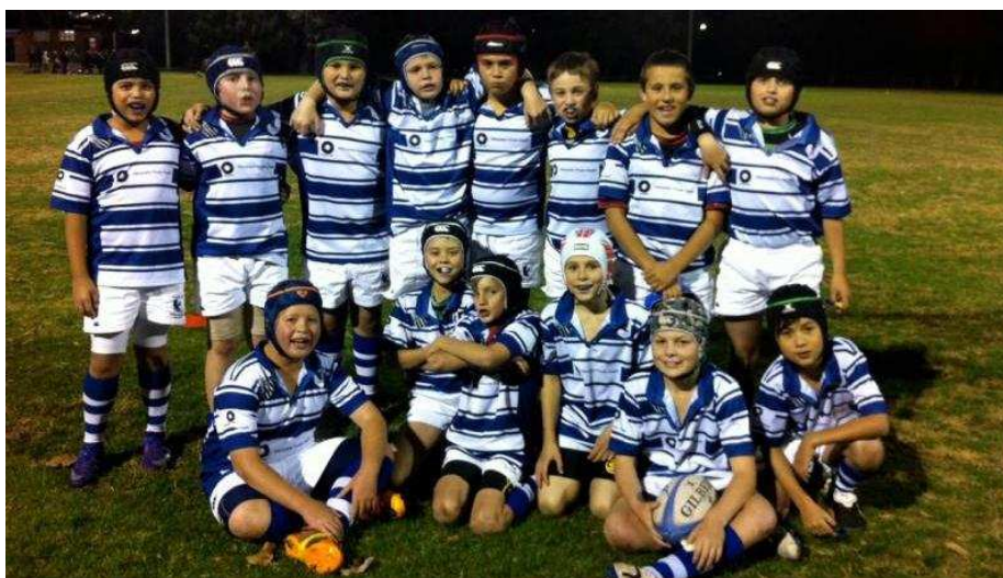
Clovelly U11 Reds