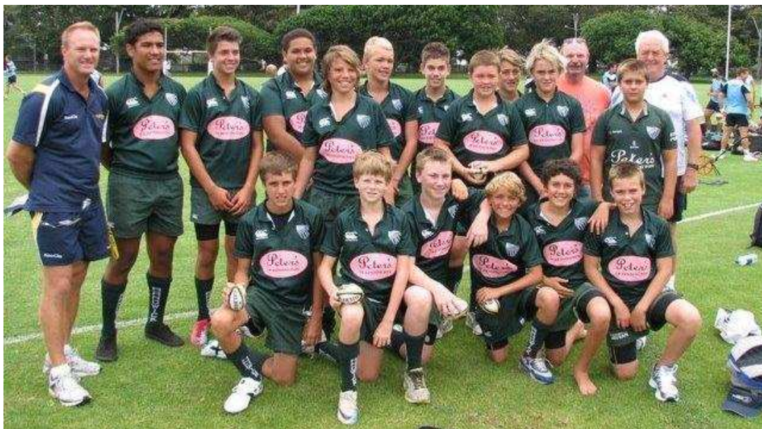
Waratahs Training Visit January 2012