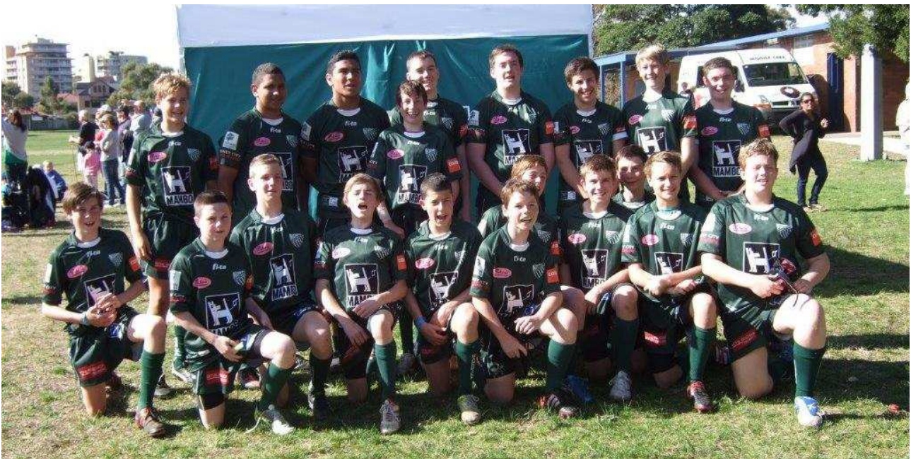
Randwick Warriors U14 - 2012