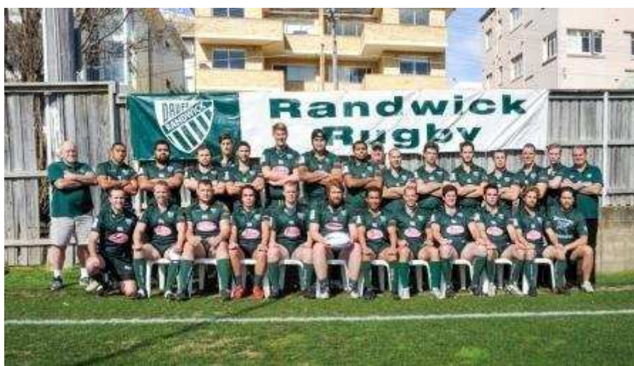
Fourth Grade Team

* includes ___ walkover points and _ penalty try