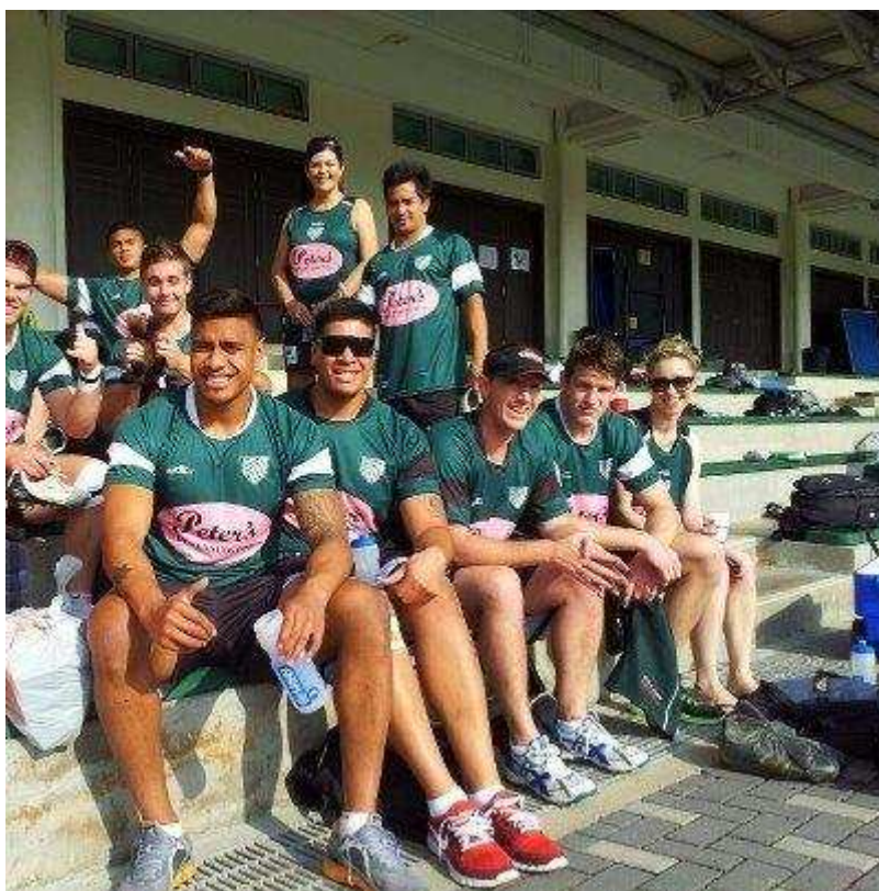
Singapore Cricket Club 7s - 2012

I take this opportunity to express my sincerest gratitude to our many sponsors and partners. Your support is never taken for granted and we look forward to working with you all to grow Randwick Rugby well into the future. The Randwick Rugby Club is indebted to its sponsors and 2012 was no different.