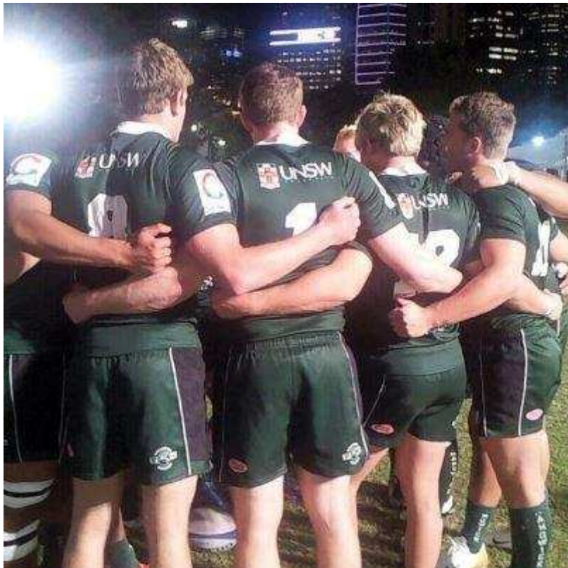
SSC UNSW 7s 2012

To the Club's loyal supporters that continue to turn up year after year and make Coogee Oval such a fantastic place to play rugby.