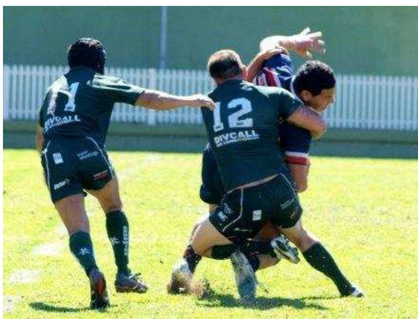
Fourth Grade Qualifying Final win vs Eastern Suburbs

Following that game I recall Joe saying to me that we needed to win every game from here to make the semis and that we just needed to work harder - I have to admit that it seemed a "big ask" at the time but Joe was right - we went on to win the next 11 games straight something I note that no other grade or club side accomplished in 2012.