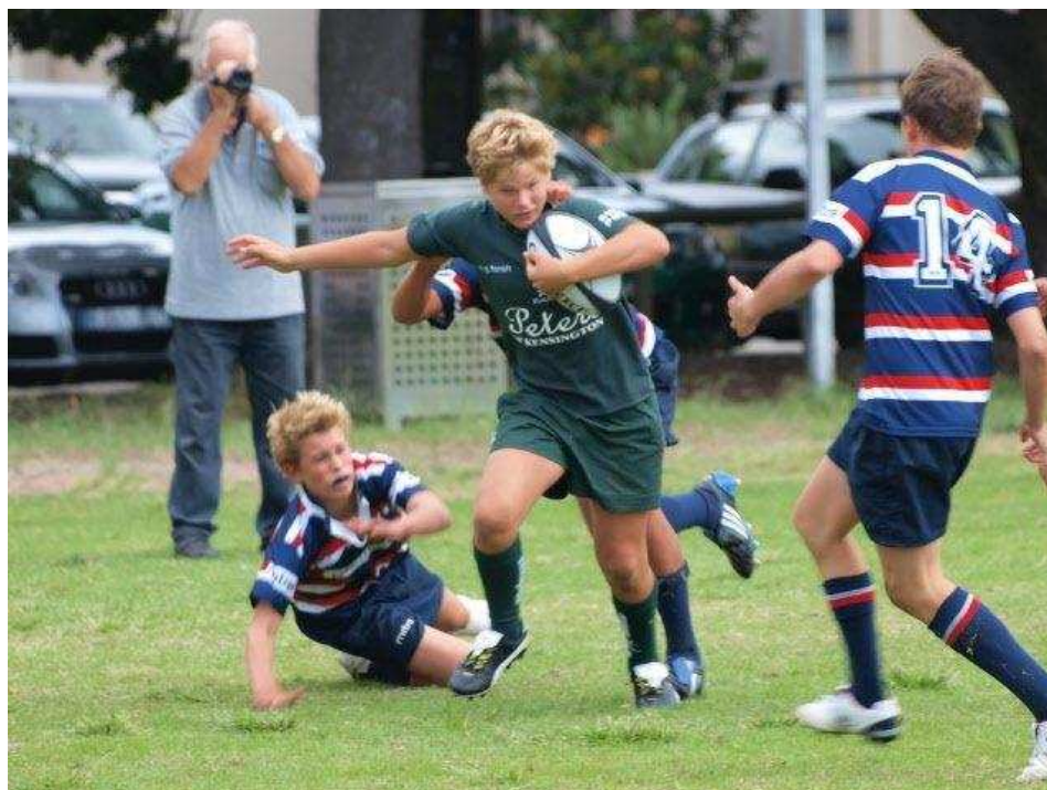
2012 Randwick Junior Sevens

As a follow up on a 2011 Sevens tournament run for village clubs and local schools it was decided to revamp the concept for 2012, play the tournament on a Sunday in March and invite teams from Sydney wide to play the locals. All up 54 teams entered including 24 from our village clubs and 30 from visiting teams. Age groups were U10 - U14 with this tournament being the first taste of Sevens rugby for the majority of the players. Our thanks to the local referees who presided in 104 games of football throughout the day. Also on hand was the development staff from the Australian Rugby Union.