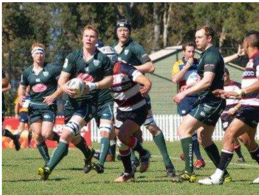
Second Grade vs. West Harbour

After winning only one game of the first five things were looking bleak. However the players put their heads down and worked hard to finish 6th after the first round. The competition was then broken into the farcical two groups which helped us ultimately finish 4th.