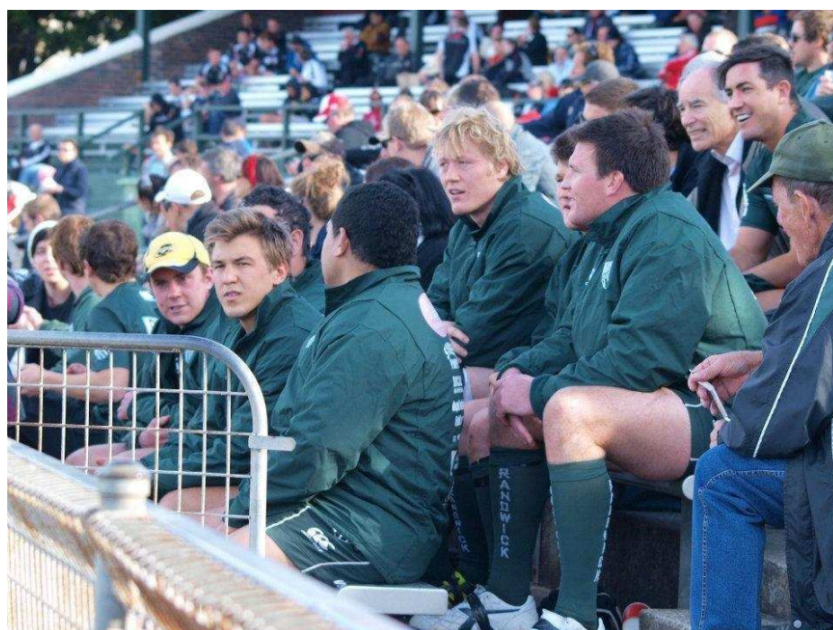
The bench 18 August 2012