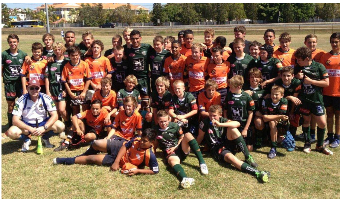
Randwick u13 vs Gold Coast 2012 tour

“The Lennox Heads Trojans. Won their fifth consecutive Far North Coast Rugby First Grade Grand Final last Saturday. Not to be outdone, the Junior Trojans had earlier won the under 12s, 13s, 14s and 15s Competitions. The town has no bank, no police station, but by Gawd they have a rugby club.”