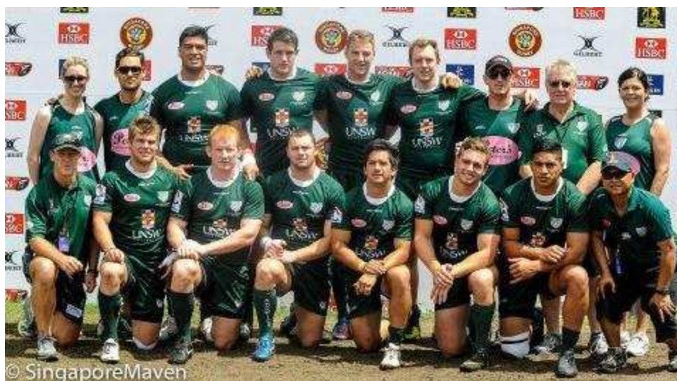
Randwick in Singapore