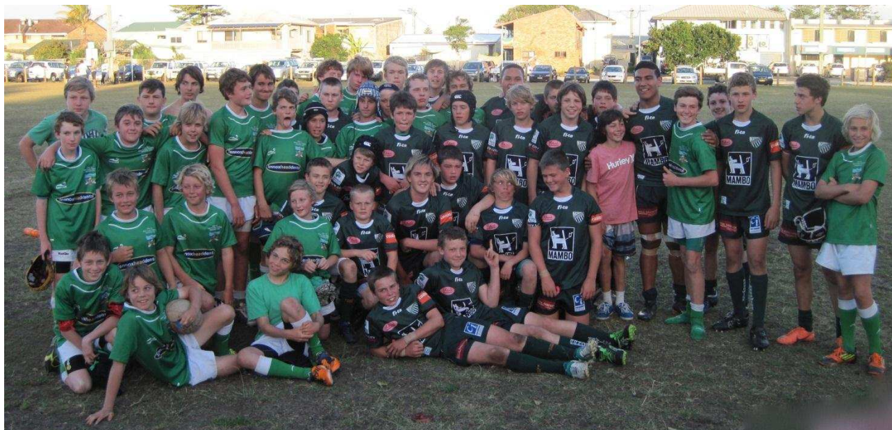
Randwick U13 vs Lennox Head 2012 tour

After the game Randwick invited the Gold Coast Academy coaches, players, parents and supporters back to the reserve outside the local surf club for a BBQ and soft drinks. All parties mingled and enjoyed each other's company.