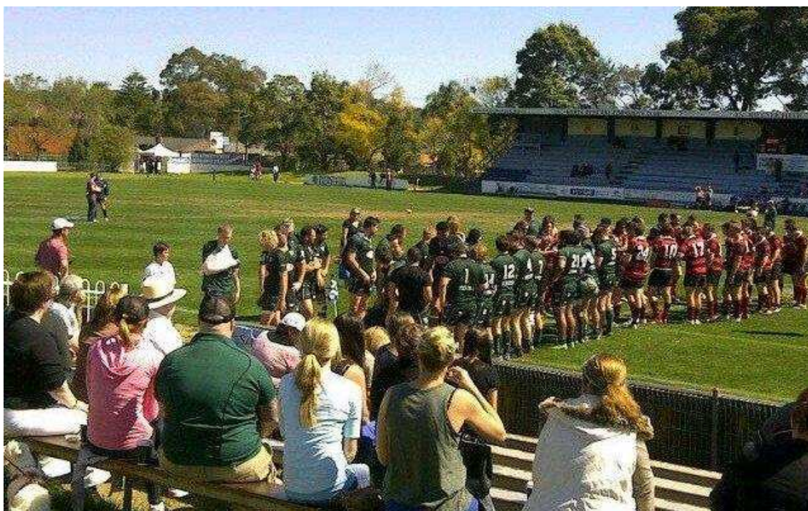
Fourth Grade's loss to Norths in the Preliminary Final at T.G.Millner

As a coach you strive to achieve these things but when they happen it is inspiring, it's why we do what we do.