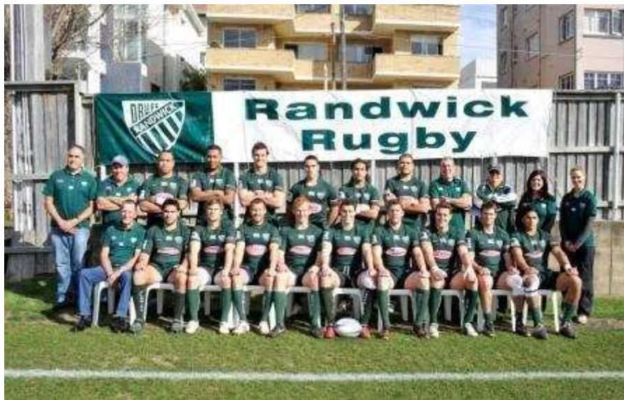
First Grade Team