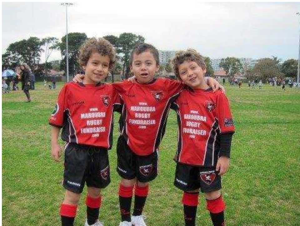
Maroubra Missiles minis new strip