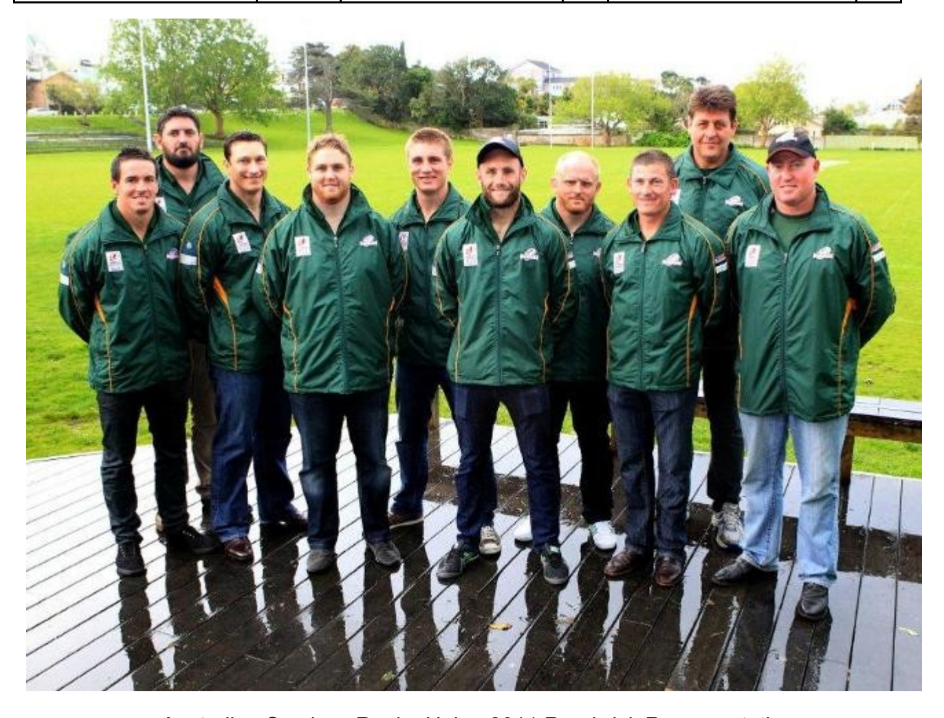
Australian Services Rugby Union 2011 Randwick Representatives